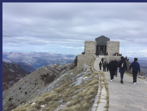
Montenegro Geography Trip

Students returned from the trips enthused with memories and stories and many staff returned looking forward to getting back into their own bed! During the Easter break I was returning home from being in Croatia with family when I encountered a returning member of staff who had been on the school trip to Montenegro. Tired from the trip she had alighted at the wrong car park stop (easily done at Gatwick airport) so was getting another bus to correct this wrong (she clearly was not listening to the correct voice and had therefore been led astray!). She had enough energy to share some of the wonderful experiences from an excellent trip away.