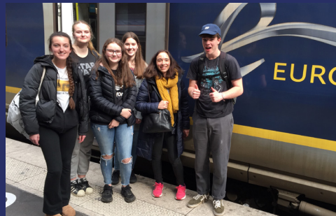
French Work Experience Trip

so well abroad, the staff for giving up their time to take the students and you, the parents, for trusting them to do so!